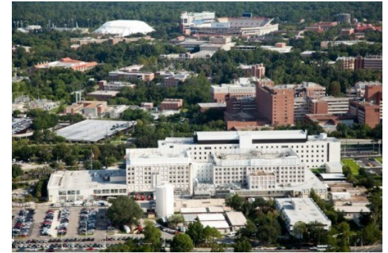
VA campus in foreground

**Most rotations are 8-5 with no call, nights or weekends.